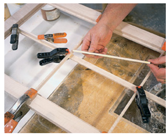
Flip the door over again and begin to cut and install the three backer pieces that complete the "T" for the glass and run from muntin to muntin. These pieces back the face piece. Glue and clamp until dry.