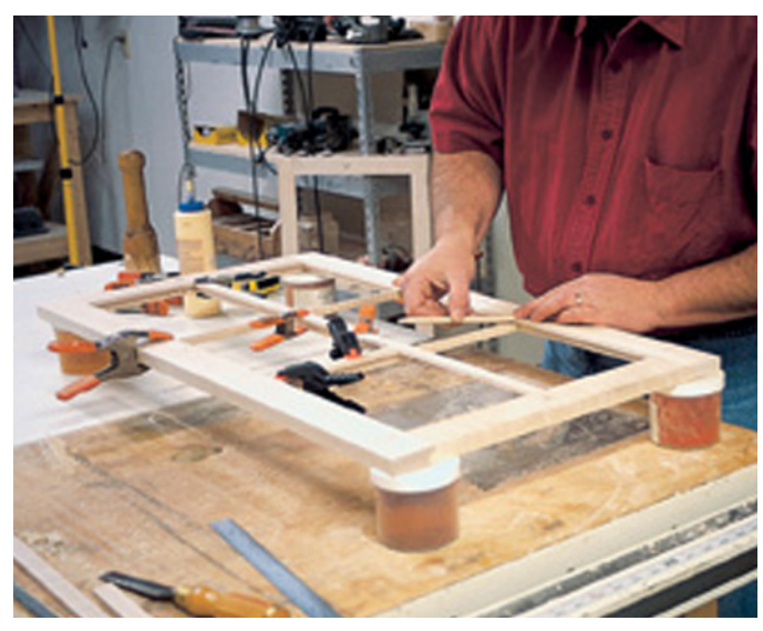
Finally, flip the door face up one more time and cut and install the remainder of the face pieces. You can install all the pieces at one time, without allowing each piece to dry. You're limited only by the number of clamps you own, but don't work so fast that things get sloppy. PW