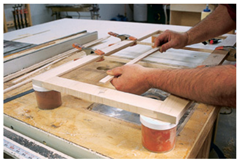
Now flip the door over. The first face pieces to install are the pieces that run the full length, in this case the center piece that divides the glass area vertically into two sections, left and right. The piece again needs to be snug, but not too tight. Glue each end (as well as each area) where the face crosses the backers (two locations in this case). You'll notice that I have the door elevated on some jars. The contents aren't important, but the elevation is very helpful.