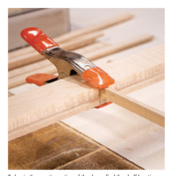
To begin the muntin section of the doors, find the shelf locations on your project's case (generally the glass dividers align with the shelves) and mark these on the edges of the door. Cut the backer material to run from side to side. These pieces divide the glass area horizontally. The fit should be snug, but not so tight as to bow the frame. Glue the backer piece into the rabbet area and clamp until dry, usually about 30 minutes.