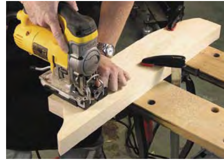
Use double-sided tape and clamps to keep your side pieces firmly together as you make your relief cuts and curve cuts.