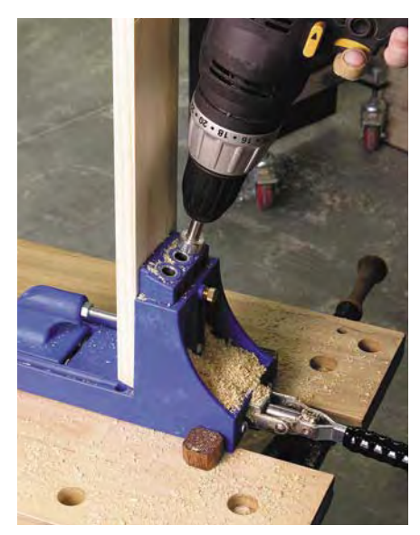
After securing the board firmly in the jig, squeeze your drill's trigger and allow it to get up to speed before drilling into the wood.

To download the free manual, visit ICanDoThatExtras.com.