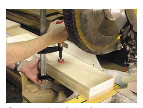
Clamp up your three side pieces (one is an extra) being sure to align the long edges as much as possible. Then, trim the ends flush.

Next, mark the placement of the pocket holes on the bottom of each shelf, <sup>3</sup>/<sub>4</sub>" in from each long edge. Set the jig for <sup>3</sup>/<sub>4</sub>"-thick material, and make a few practice holes in scrap material. When you feel confident, line up the mark on the shelf with the mark on the jig as shown at right, secure the shelf in the jig, and