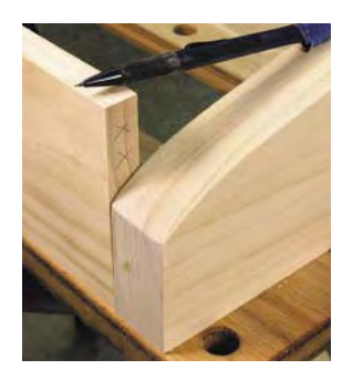
Fit the shelves against the two side pieces, and carefully mark the width in relation to the curve of the side. Then, cut with your jigsaw.

drill your pocket holes using the bit provided in the kit. For the best result, keep the angle of your drill in line with the angle of the hole, and squeeze the trigger while the bit is at the top of the hole to allow it to get up to speed before making contact with the wood. Now drill the remaining 15 pocket holes.